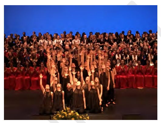
Music. Let's meet all together in Barcelona!