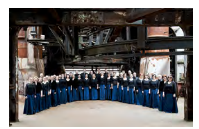
KAMMERCHOR SAARBRÜCKEN – Germany

Founded in 1990 by its conductor Georg Grün, the choir advanced to become one of the leading German chamber choirs within a very short time and enjoys an excellent international reputation. The choir performs works by the most important composers of the Middle Ages, Renaissance and ancient classical vocal polyphony, and is also active in the area of historical performance practice of the 17th and 18th century. The choir has won important prizes at international competitions like the "Let the Peoples Sing!" competition in 2003. Kammerchor Saarbrücken has published many CDs with