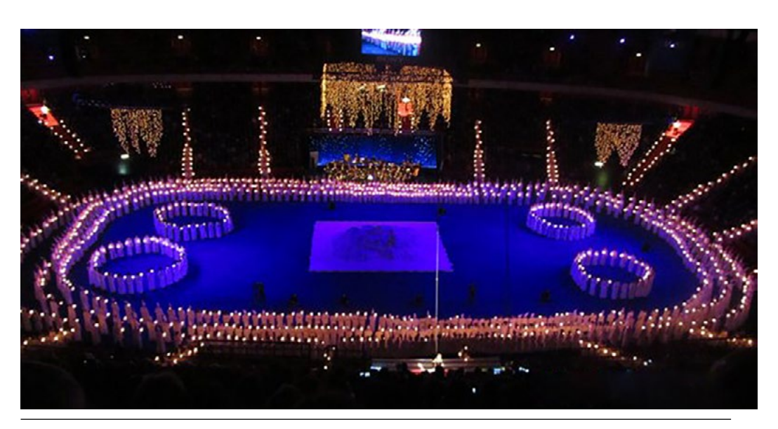
1400 Singers from Adolf Fredriks Music Classes and the Stockholms Musikgymnasium during a Lucia concert celebrated together with the World Choral Day