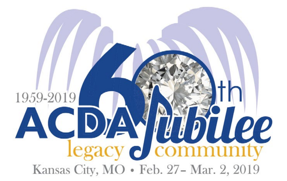
Exhibit and advertising registration is open through Nov. 27. Composer Fair Registration is open through Dec. 1. General registration opens Oct. 1. This "jubilee" conference will celebrate ACDA's 60th anniversary. More info HERE