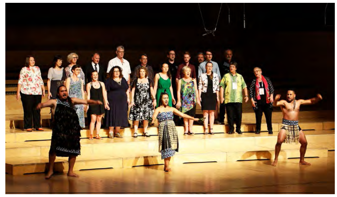
Delegation from New Zealand performing at the WSCM11 closing concert, 29 July 2017, Barcelona

The theme of the 12th World Symposium on Choral Music (WSCM2020), to be held in Auckland from 11 to 18 July 2020, was announced a few weeks ago. We believe it is not only evocative of New Zealand but will also resonate with the rest of the world. For those who wish to be considered to perform or give lectures/workshops at WSCM2020, a call for choirs and presenters will soon be sent out through all our media. The Artistic Committee of WSCM2020 requires all proposals to directly relate to the theme of the Symposium 'People and The Land' .