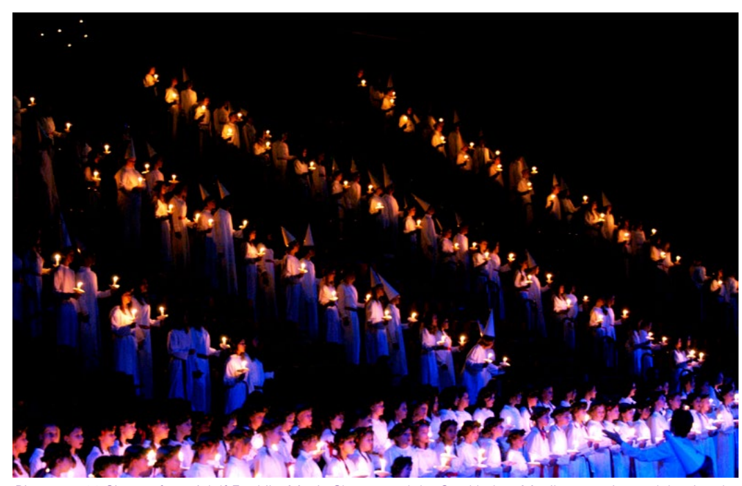
Picture: 1400 Singers from Adolf Fredriks Music Classes and the Stockholms Musikgymnasium celebrating the World Choral Day during their annual Lucia concert

In 2018, a special anniversary makes the World Choral Day even more valuable - the 100th anniversary of the end of the WWI extends the timeframe of this global action and makes possible the virtual participation of choirs around the world for more than one month!