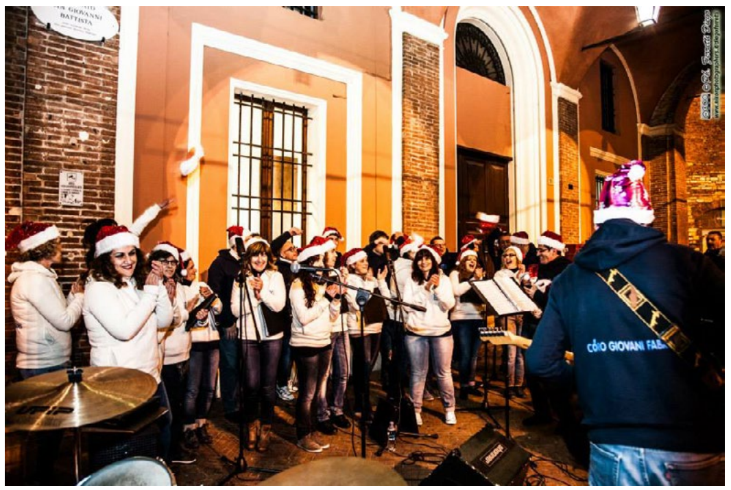
Coro Giovani Fabrianesi, Italy, celebrating the World Choral Day (2014)

The resulting composite of all recordings will be compiled by Fundación Aequalis and a final video will be produced. This video will be released on December 7th in connection with the celebration of the World Choral Day. This video will be globally distributed through social media and individual websites. For more information on this initiative, please contact IFCM at <a href="mailto:communication@ifcm.net">communication@ifcm.net</a>, Fundación Aequalis in Caracas at <a href="mailto:info@ciccag.org">info@ciccag.org</a>, or visit: <a href="mailto:https://www.ciccag.org/en/virtual-choir-voxpopuli">https://www.ciccag.org/en/virtual-choir-voxpopuli</a>