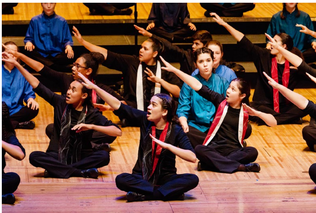
Gondwana

The renowned Australian children's choir Gondwana will speak (or rather, sing) directly to the theme of the Symposium, "People and the Land | He tangata, he whenua." Comprising singers from the Gondwana Indigenous Children's Choir, the Sydney Children's Choir and Gondwana Voices, Gondwana has established an international reputation for beautiful and imaginative choral performance. Its repertoire will include works commissioned by Gondwana, reflecting stories, language and events that have shaped the Australian continent and its people.