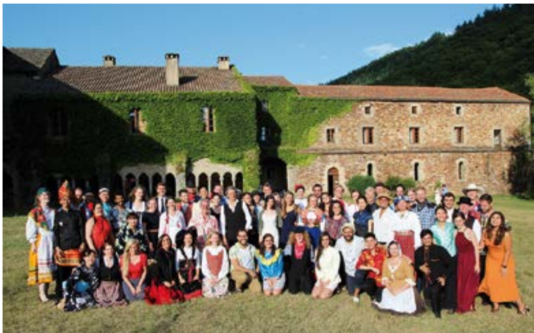
The World Youth Choir singers in traditional clothing, showcasing the cultural richness of their 29 different countries of origin in front of the beautiful Abbaye de Sylvanès (Sylvanès, July 28, 2019)

The World Youth Choir (WYC) has recently updated its video collection of WYC performances during the past two decades. In addition to this collection of performances on the WYC website, more WYC performances can be accessed on the WYC YouTube channel and the WYC Vimeo channel . Of particular interest is the recording of the full concert of the 2019 World Youth Choir at Teatro Nacional São Carlos in Lisbon on 30 July 2019. Conducted by Maestro Josep Vila i Casañas, this performance marked the celebration of the 30th anniversary of the World Youth Choir program.