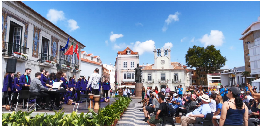
World Choral Expo 2019 in Cascais, Portugal

Each month, the IFCMeNEWS will feature one or two of the WCE 2022 invited choirs. Here is an introduction to the two professional choirs you will get to hear and work with.