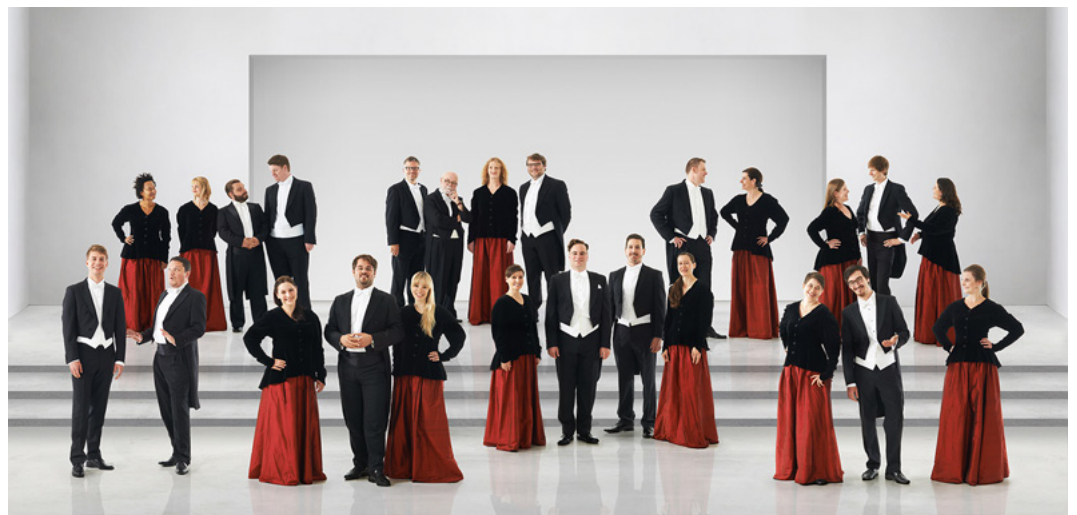
Kammerchor Stuttgart

Ordinarius' goal is to offer quality vocal music that draws on many styles and sources. Their performances offer the audience the opportunity to sit back and enjoy the best that vocal arrangement can offer, as well as a chance to sing along and join the fun!