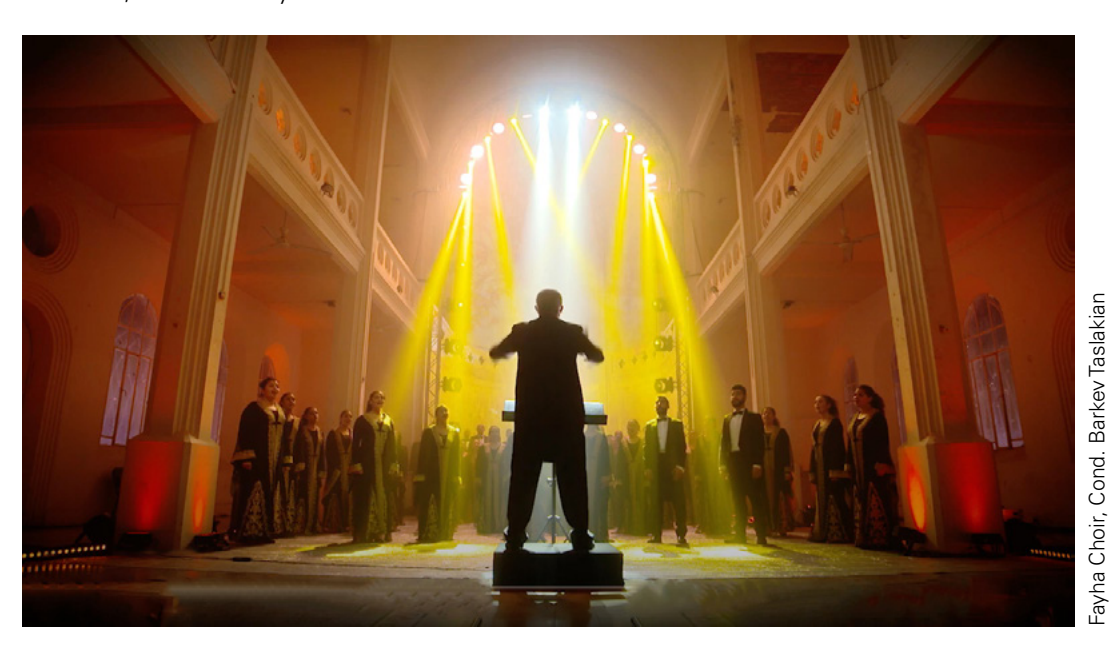
CHORAL CANADA/CANADA CHORAL

This initiative also comes within Fayha Choir's plan for promoting collective singing in Lebanon and Arab countries. Enjoy this video from the first joint rehearsal in which singers met for the first time, conducted by Maestro Barkev Taslakian.