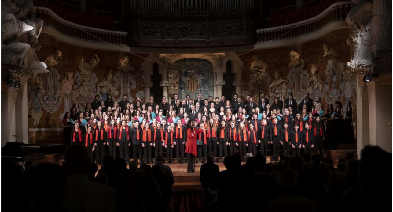
Festa de la Música Coral 2023