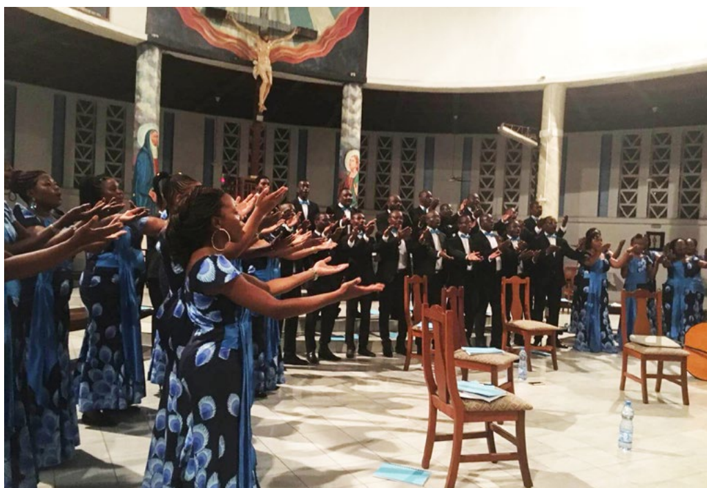
Choral Days A Coeur Joie Gabon: Grand Choeur A Coeur Joie Gabon, Groupe Vocal Le Chant sur la Lowé, La Voix des Jeunes and Dominique Savio (Closing concert of A Coeur Joie choral week and training session in Libreville and Port-Gentil, Gabon)

For more information please visit: www.worldchoralday.org