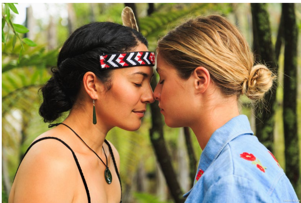
Hongi Rotorua

Selected participants will be advised in December, and the programme officially launched at the end of February when registrations open. Preregister now at https://www.wscm2020.com/ or follow us at https://www.facebook.com/wscm2020 . We look forward to welcoming you in Auckland, New Zealand!