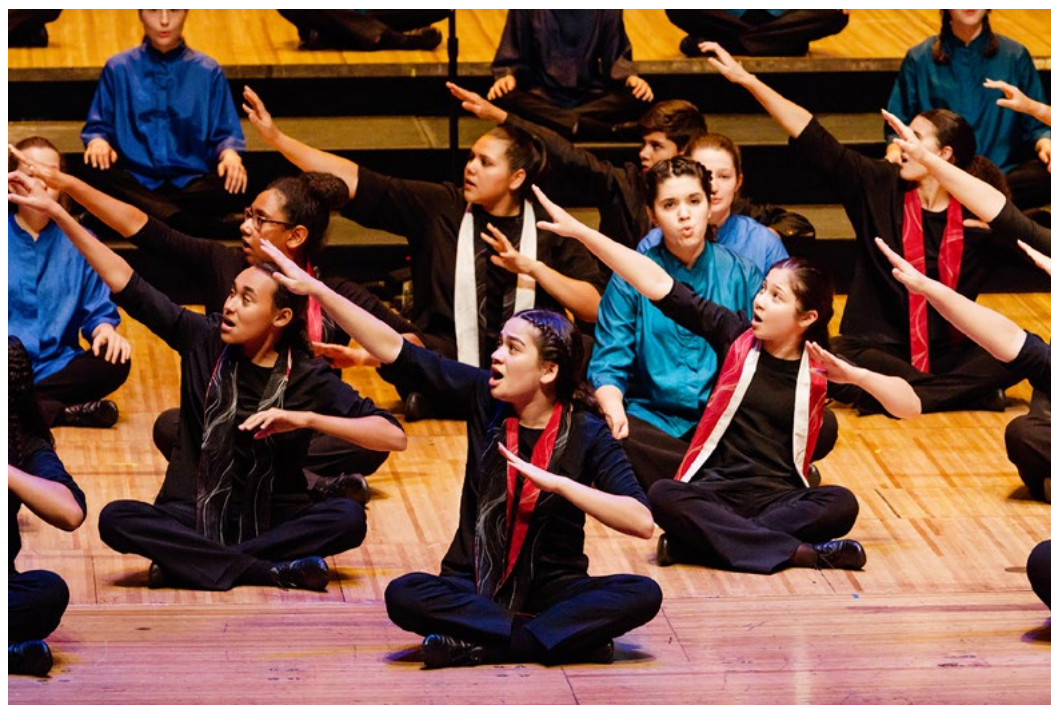
Gondwana

The renowned Australian children's choir Gondwana will speak (or rather, sing) directly to the theme of the Symposium, "People and the Land | He tangata, he whenua." Comprising singers from the Gondwana Indigenous Children's Choir, the Sydney Children's Choir and Gondwana Voices, Gondwana has established an international reputation for beautiful and imaginative choral performance. Its repertoire will include works commissioned by Gondwana, reflecting stories, language and events that have shaped the Australian continent and its people.