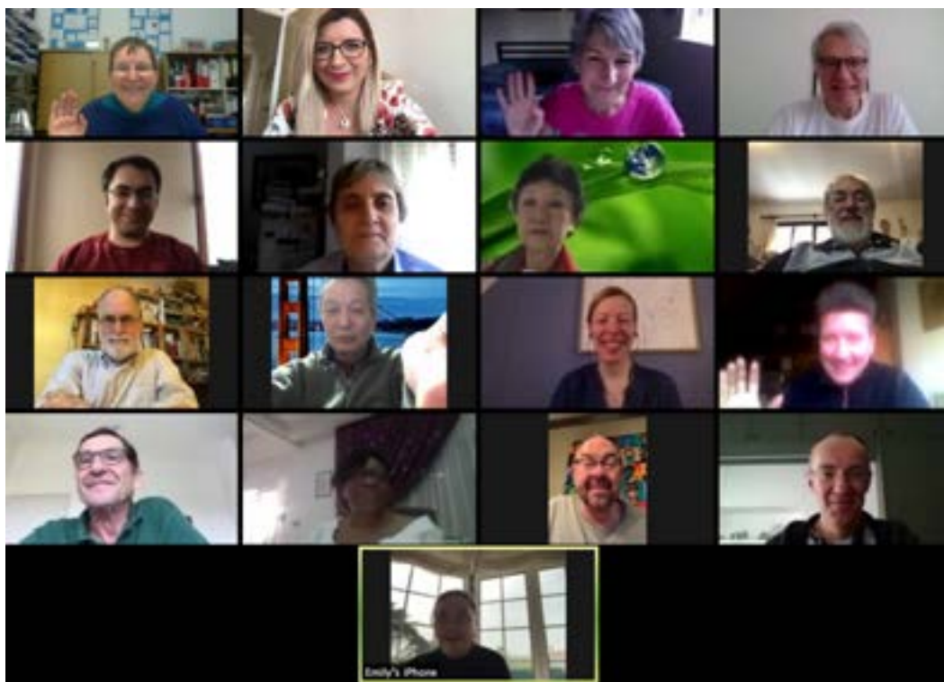
Discover IFCM Pictures like this one of the last virtual Board meeting on March 19, 2020.

In recent years, IFCM began putting more emphasis on social media channels. This initiative resulted in one of the highest numbers of followers on Facebook in the choral field. While, in addition to Facebook, IFCM is already present on Twitter and YouTube, we are excited to launch our new official Instagram channel. Here we will share interesting daily choral content about trending news, festivals and event deadlines, amusing photos and videos, and so much more. Please follow us on Instagram to make sure you don't miss our important choral news and content.