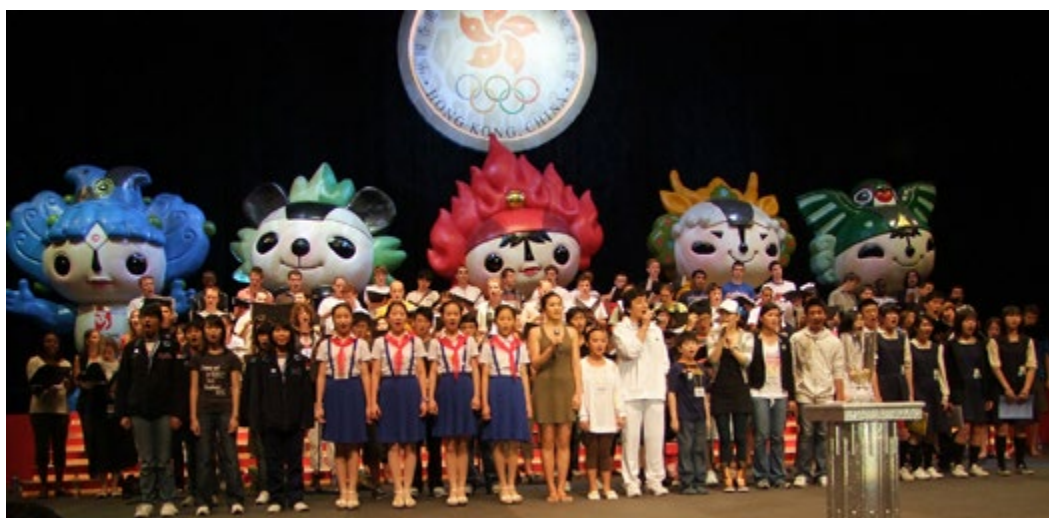
WYC at the Summer Olympics 2008 in Hong Kong