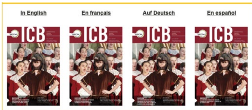
International Choral Bulletin, Volume XXXVIII, Number 2, 2 nd Quarter, 2019

with easy access for Russian-speaking visitors. The ICB articles (as well as IFCMeNEWS) have already been published in Chinese on the IFCM WeChat account for the past 10 months. The WSCM 2023 Team in Doha is actively creating a network of translators from Arabic countries.