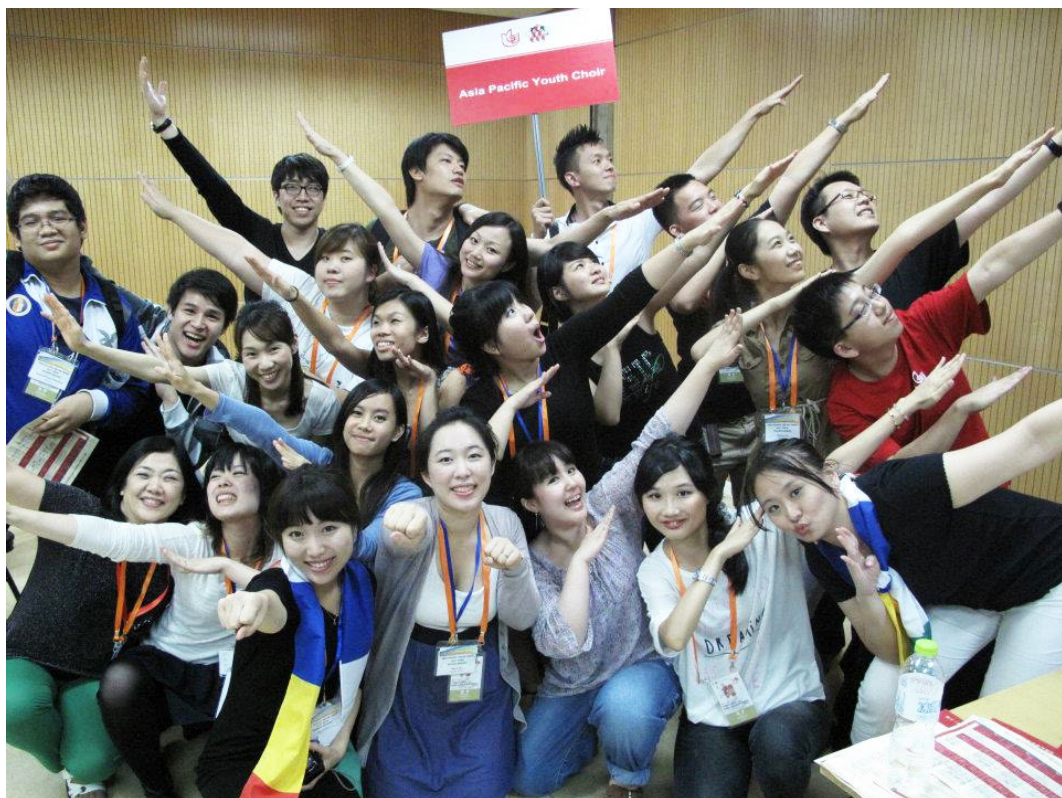
One of the first sessions of the Asia Pacific Youth Choir

The Planning Committee for the 2023 World Symposium on Choral Music (WSCM) is delighted to announce the patronage by the State of Qatar's Ministry of Culture and Sports for the 2023 WSCM. The WSCM is to be held in Doha, Qatar, 30 December 2023 to 5 January 2024.