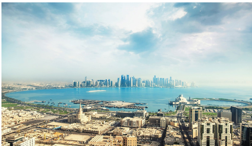
West Bay skyline, Doha, Qatar