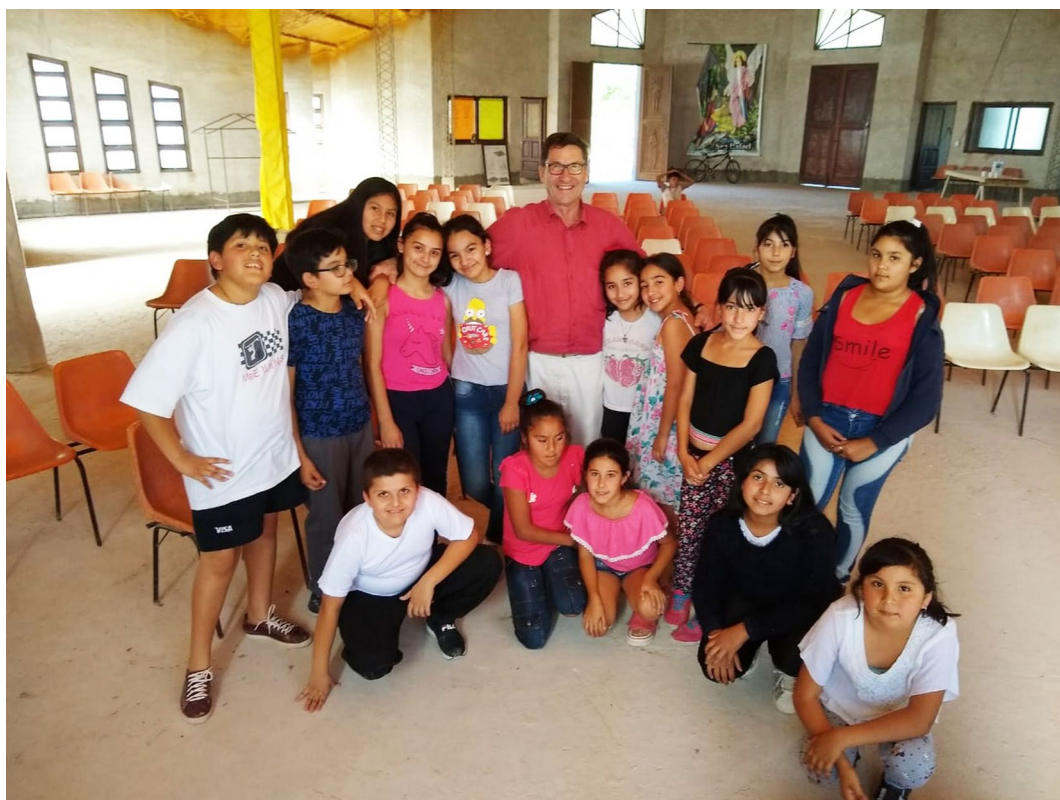
CWB in Argentina in 2019

In addition to on-site sessions, video training will be organized in all regions for basic conducting techniques, a cost-effective and pedagogically-successful approach already in use by CWB in Latin America.