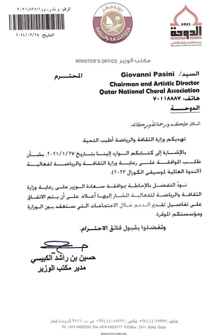
Right: West Bay skyline, Doha, Qatar — Left: the letter from the Ministry of Culture and Sports confirming its patronage