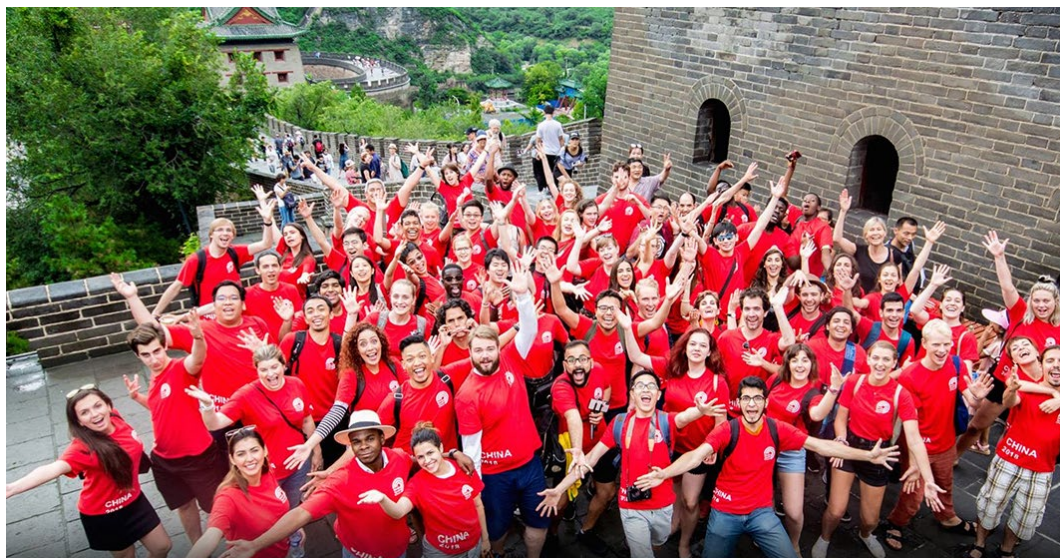
WYC 2018 on the Great Wall of China

Given the uncertain global situation for the remainder of 2021, the WYC Foundation Board has decided not to plan a regular session in 2021. Several options are currently being discussed for the years 2022 and 2023, including a session in Qatar with the Arab Choral Network . In September 2020, the WYC Foundation was delighted to participate in an Online Reception organised by the European Choral Association as part of the EP:IC project. Anyone interested in hosting a session of the World Youth Choir or supporting the choir in one way or another can write to manager@WorldYouthChoir.org for further information.