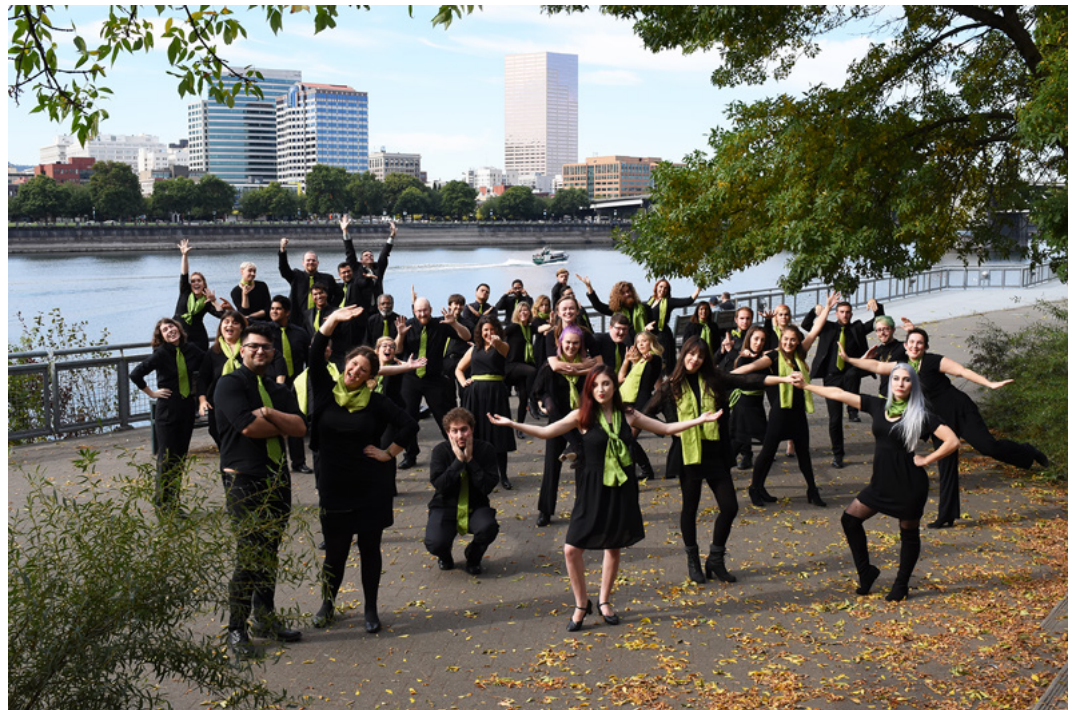
Portland State Chamber Choir

Don't forget to follow us on WCE Facebook or on http://worldchoralEXPO.com .