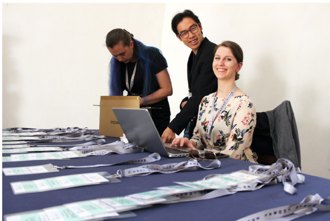
YOUNG 2022 - World Choral EXPO, Oeiras, Portugal

With the great success of the YOUNG program in the frame of the World Choral EXPO 2022, we are happy to announce the call for the second YOUNG program! Are you aged between 18 to 35? Do you want to be a part of the organizing team of the World Symposium on Choral Music 2023? IFCM and the Choral Culture Association, Istanbul, Türkiye, are launching a call for young international cultural managers to be a part of their team and expand his or her experience and field of competence while working closely with the organizing team of WSCM 2023.