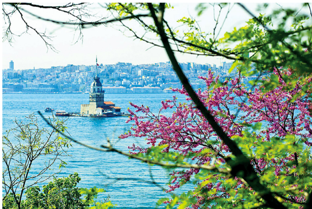
Judas trees blossoming before Maiden's Tower © Kız Kulesi

As we welcome the New Year, the excitement for WSCM 2023 is rising, not only in Istanbul, but all over the world. Registration continues for the international symposium to be held