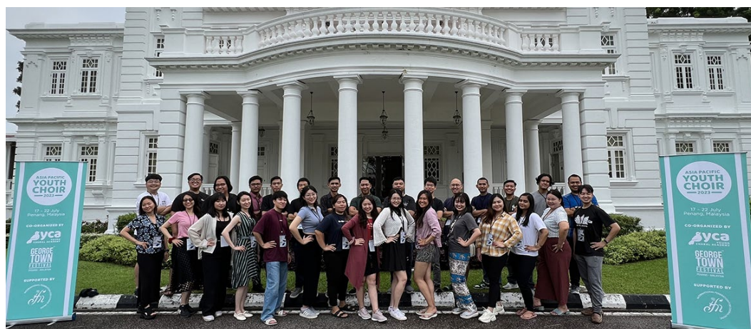
APYC at the Warasan Open University

A big thank you to the George Town Festival, the Young Choral Academy for their support and collaboration in making this event possible, and our deepest gratitude to the two conductors of