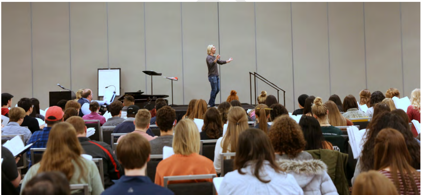
A rehearsal of the ACDA National High School Honor Choir, directed by Eric Whitacre.

A wonderful week of beautiful music soothed the troubled soul. The next ACDA National Conference will be in Kansas City, Missouri, Feb/March, 2019, which will be the Diamond Jubilee of American Choral Directors Association.