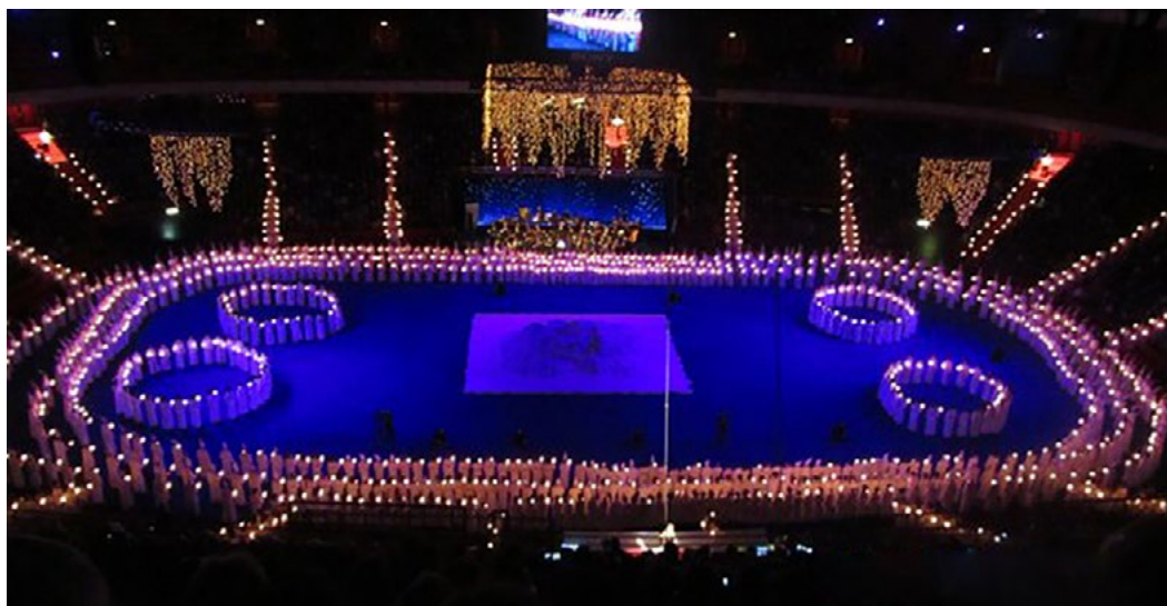
1400 Singers from Adolf Fredriks Music Classes and the Stockholms Musikgymnasium during a Lucia concert celebrated together with the World Choral Day