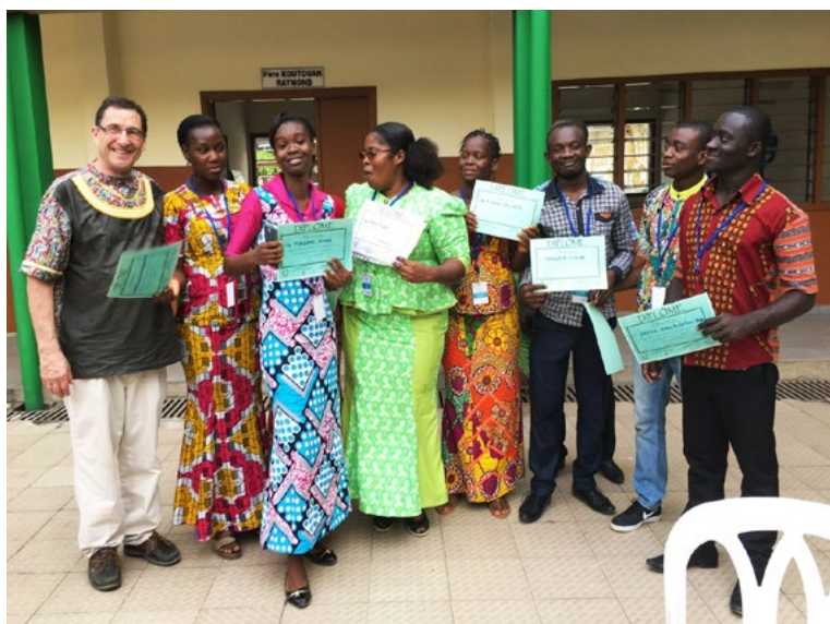
Abidjan, Côte d'Ivoire