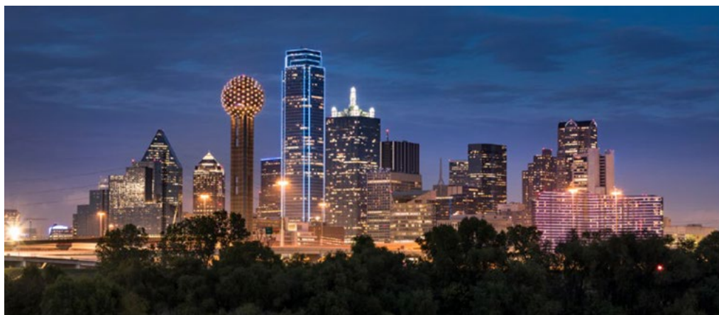
ACDA National Conference 2021 (Dallas, Texas, USA)

ACDA National Conference - Mar. 17-20, 2021 (Dallas, TX)