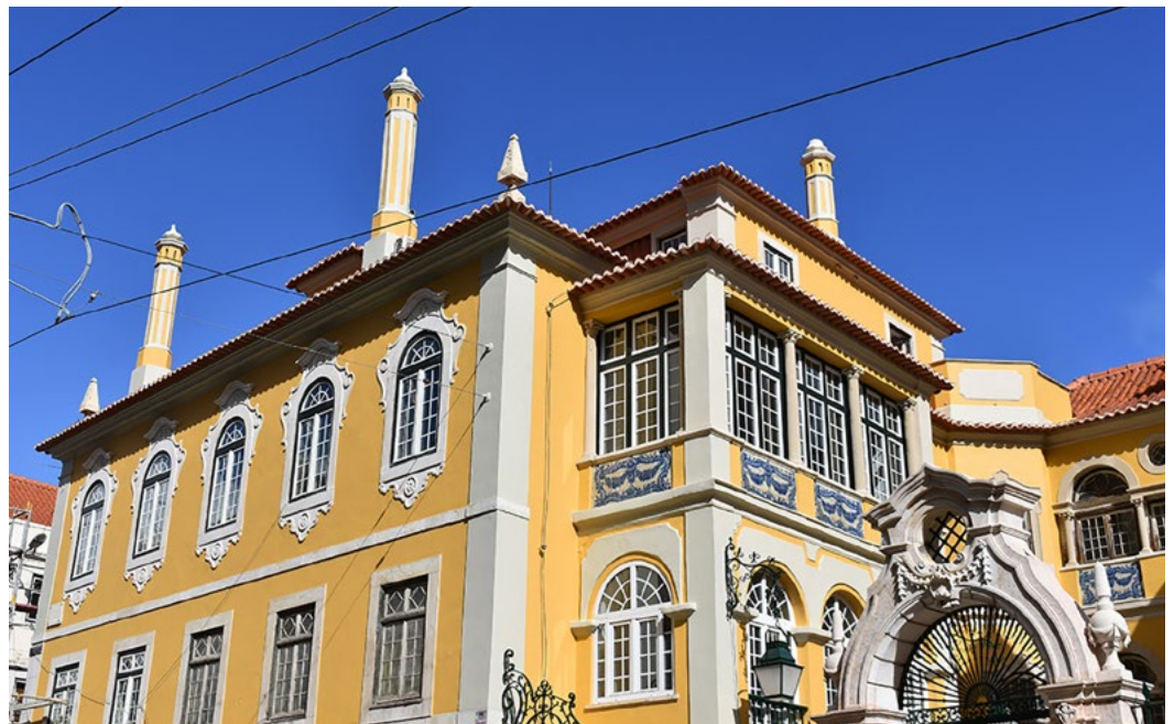
New head office of IFCM, Palacete dos Condes de Monte Real, Lisbon

IFCM is happy to announce that a new version of the Bylaws and the IFCM Certificate of Incorporation , as well as a new IFCM internal Policy document , were unanimously voted by the General Assembly. All these new documents can be found by clicking on their respective name.