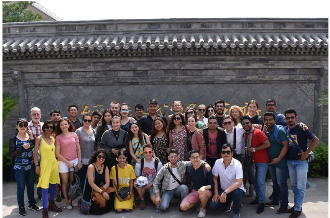
SCO Countries Youth Choir Singers visiting the ancient residence of generals

SINGERS from 16 countries: Afghanistan, Armenia, Belarus, Cambodia, China, India, Iran, Kazakhstan, Kyrgyzstan, Mongolia, Nepal, Pakistan, Russia, Sri Lanka, Turkey, Uzbekistan. Singers were invited from Azerbaijan and Tajikistan but, unfortunately, they could not get visas in time to attend the session.