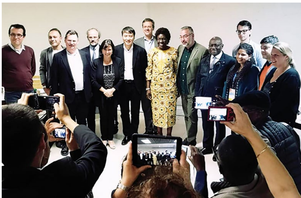
The new leadership team of the International Music Council