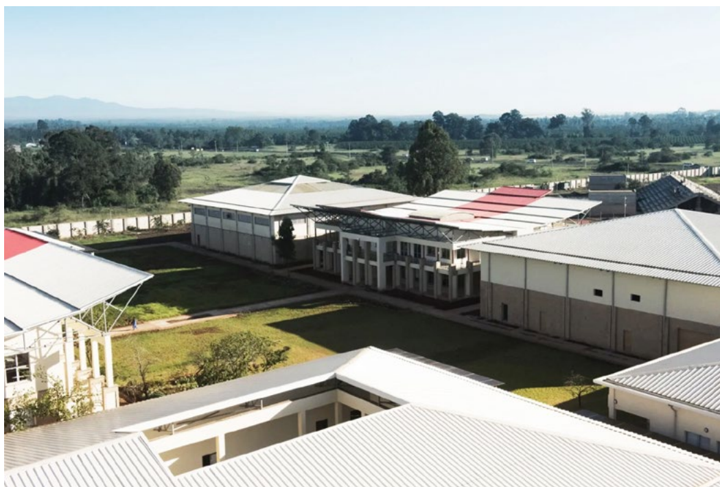
Mpresa Foundation Auditorium (center), one of the venues of the Festival

For more information, visit the Africa Cantat website or contact the festival directly via email . Come to Nairobi and enjoy the rich diversity of choral music from different regions in Africa and other countries worldwide! Jambo Kenya!