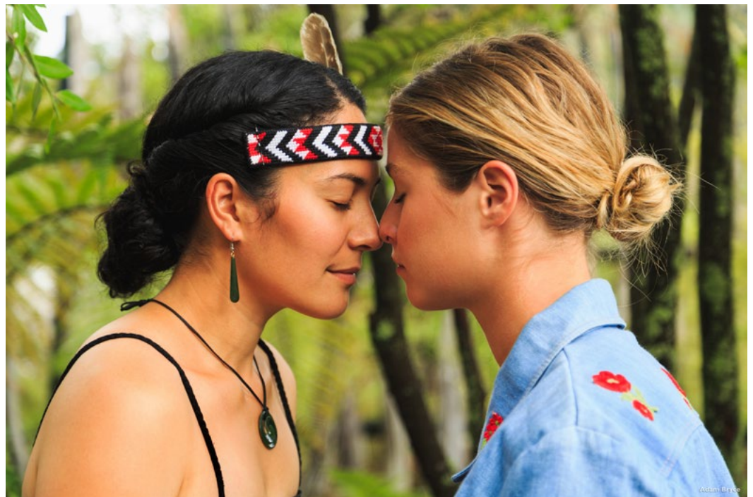
Hongi Rotorua

We look forward to welcoming you in Auckland, New Zealand!