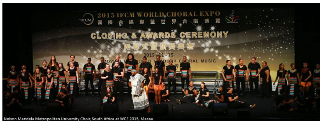
Nelson Mandela Metropolitan University Choir, South Africa at WCE 2015, Macau

See World Choral EXPO 2019 for more information with participating conditions and registration details. Follow the World Choral EXPO Facebook page for up-to-date details. World Choral EXPO 2015 | Highlights from the closing ceremony video