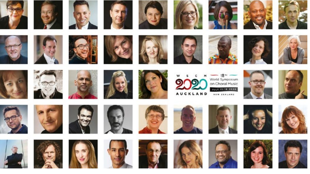
Earlybird registrations are available until July 2019, offering you a minimum of 10% discount on fees.