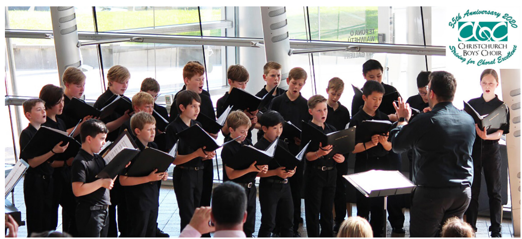
On Nov. 28, the Christchurch Boy's Choir dedicated their 35th Anniversary concert to the World Choral Day

To register/subscribe your concert, click here.