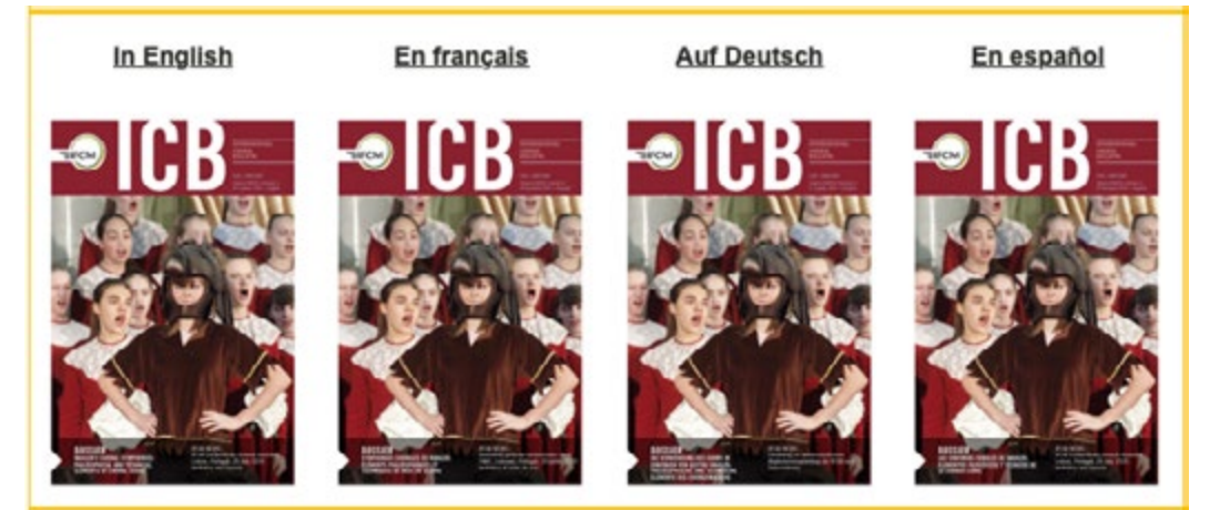
International Choral Bulletin, Volume XXXVIII, Number 2, 2<sup>nd</sup> Quarter, 2019

with easy access for Russian-speaking visitors. The ICB articles (as well as IFCMeNEWS) have already been published in Chinese on the IFCM WeChat account for the past 10 months. The WSCM 2023 Team in Doha is actively creating a network of translators from Arabic countries.