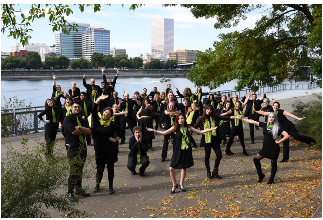
Don't forget to follow us on WCE Facebook or on http://worldchoralEXPO.com.