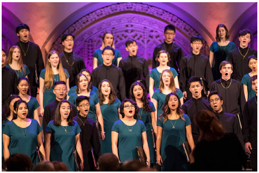
Vancouver Youth Choir, Canada