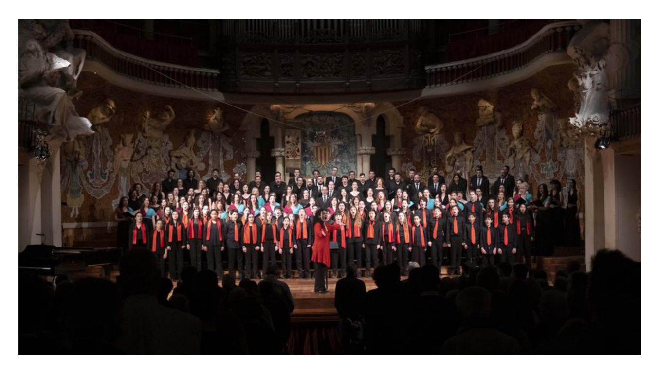
Festa de la Música Coral 2023