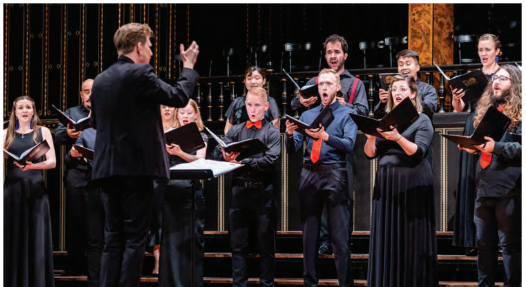
World Youth Choir conducted by Zoltán Pad in 2023

Discover the full list of singers here: WYC 2026 Session | List of Singers